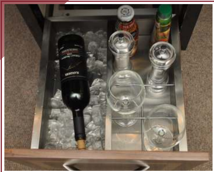
Wine / Glass Compartment